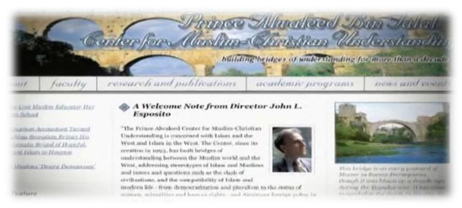
(Fig. 4), The Third Jihad: Building bridges of Muslim-Christian understanding.

Figure 5 functions against the will of the film and its producers and directors who, from the beginning till the end of the film, endeavor to demystify and distort the picture of Islam and Muslims. One of the ends of the film—as clearly seen in this film—is to reinforce hatred and animosity between Islam and Christianity. Nonetheless, this image resists this end and speaks against the efforts of the film's producers and directors.